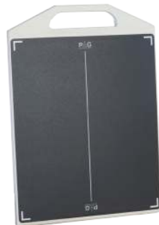
PROTECT-A-GRID: HANDLE ON SHORT AXIS, 14"