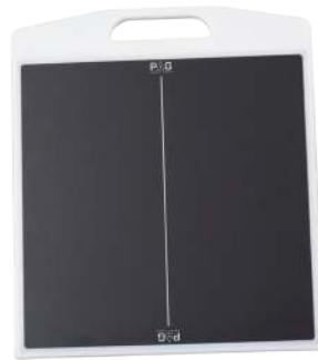
PROTECT-A-GRID: HANDLE ON LONG AXIS, 17"