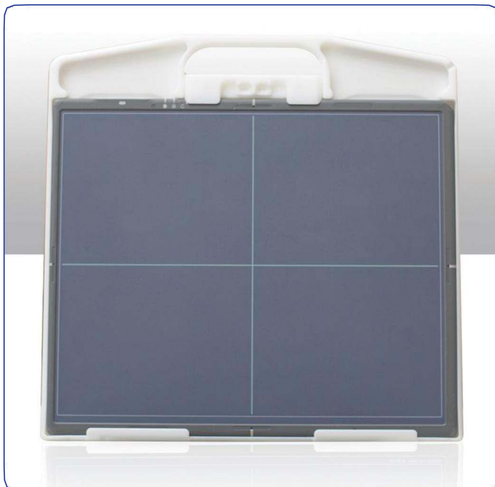
Right-Fit Mobile DRP Holder