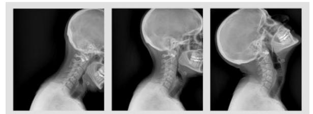
DDR is not fluoroscopy! DDR is X-ray that moves!