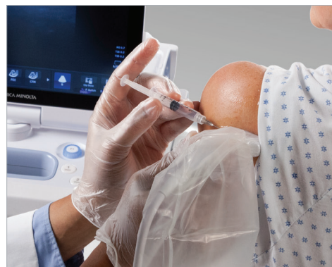
Simple Needle Visualization (SNV™) helps increase accuracy in guided injections.